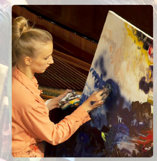
We believe in the power of creativity and culture to stretch our minds.